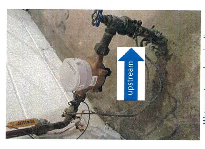
Water meter and service line originating from the floor.